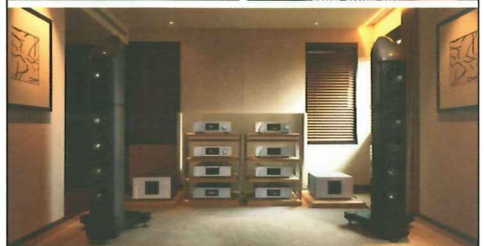
CH PRECISION, WILSON BENESCH, AND NORDOST