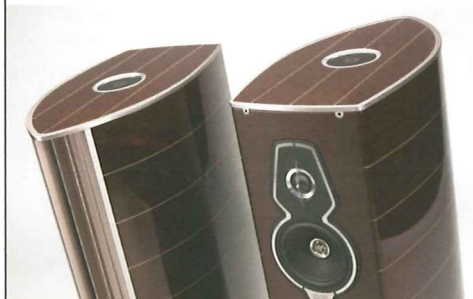
AUDIO RESEARCH AND SONUS FABER

RAV CS 5.2 ALLNIC CABLES ROON NUCLEUS NEAT IOTA XPLORER