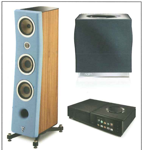
FOCAL AND NAIM AUDIO MULTIRoom