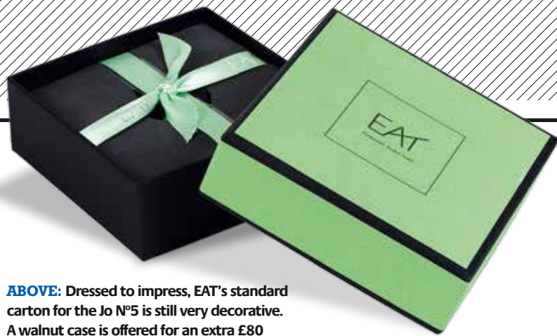
ABOVE: Dressed to impress, EAT's standard carton for the Jo N°5 is still very decorative. A walnut case is offered for an extra £80

most transparent cartridge I've used, the Jo N°5 cut through the years, revealing playback that snaps and sizzles. It has always been a test of a good system or individual component to hear what it can do with less-than-audiophilic, archival releases. It speaks volumes of the Pure Pleasure label's handiwork with this LP and the Jo N°5's adept traversing of the groove.