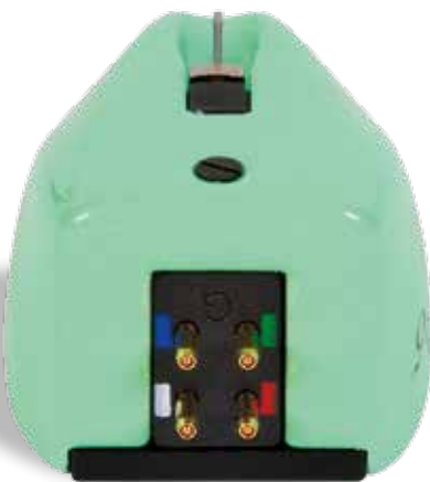
ABOVE: The shell is held in place via a small screw. The colour-coded pins are well spaced and easily accessible